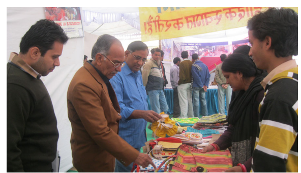
Jodhpur Market Fair