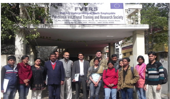
XISS Students at FVTRS, Bangalore

A batch of 20 students from Xavier Institute of Social Service, Ranchi, Jharkhand visited FVTRS on 20 December as part of their study tour to understand the functioning of social sector organisations. An orientation session was facilitated by FVTRS.