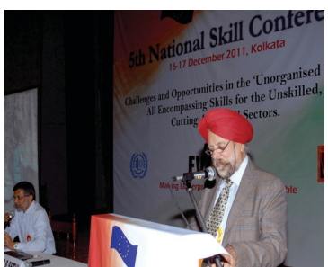
H.E. Shri MK Narayanan inaugurates NSC Release of Conference Souvenir