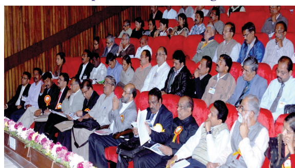
Participants at the Conference