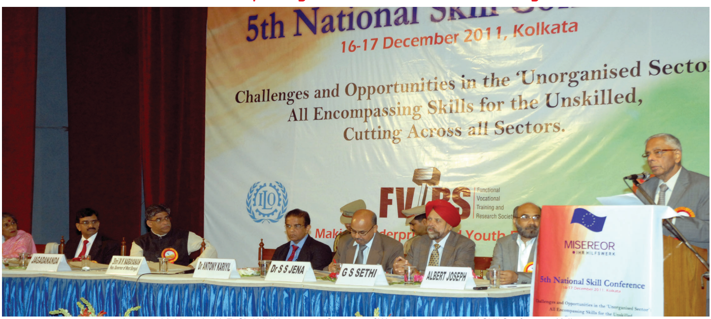
Inaugural Address by H. E. Shri MK Narayanan, Governor of West Bengal at National Skill Conference, Kolkata

'Challenges and Opportunities in the Unorganised Sector': All-Encompassing Skills for the Unskilled, Cutting Across All Sectors.