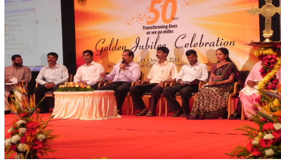
Participation in Caritas India Golden Jubilee at Bangalore

FVTRS staff attended the Golden Jubilee Celebration of Caritas India held at Bangalore on 13 October. Hon. Governor of Karnataka, Shri H R Bhardwaj graced the valedictory session as chief guest.